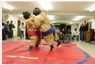
Inflatables continue to be a favorite amongst teenagers at Overtime 2010.